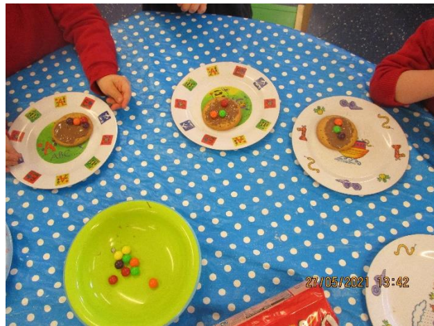
Subitising on our biscuit! What do you see and how do you see it?