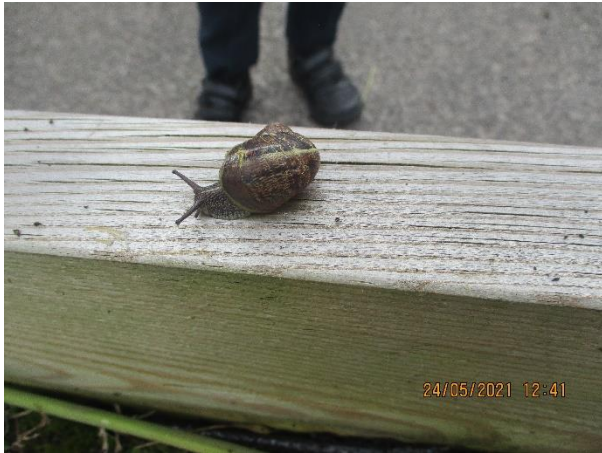
Observing a snail in the nursery garden