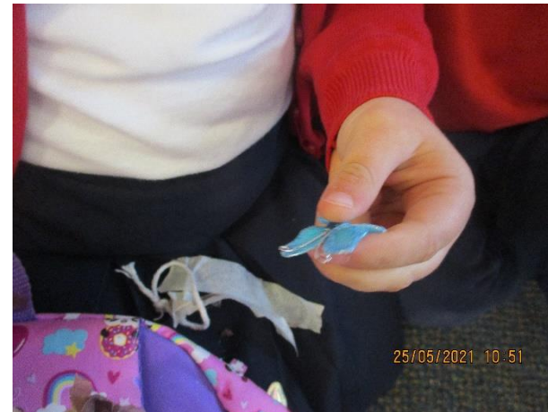
Metamorphosis took place with our play dough caterpillars.