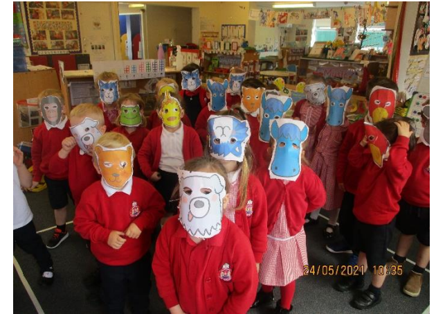
Helicopter Stories. Acting out the Brown Bear, Brown Bear story