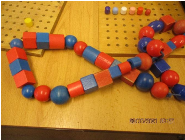
Threading (to strengthen our fingers) and pattern making