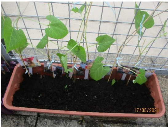
Planting our beanstalks outdoors