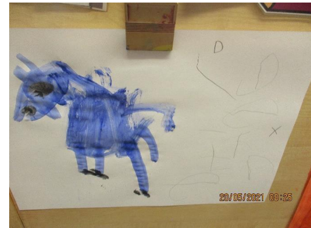
Painting a character from the Brown Bear story