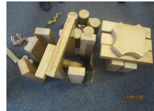
making enclosures for the animals