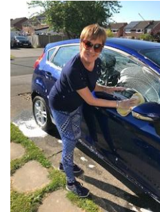
washing the car