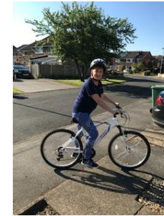
a bike ride